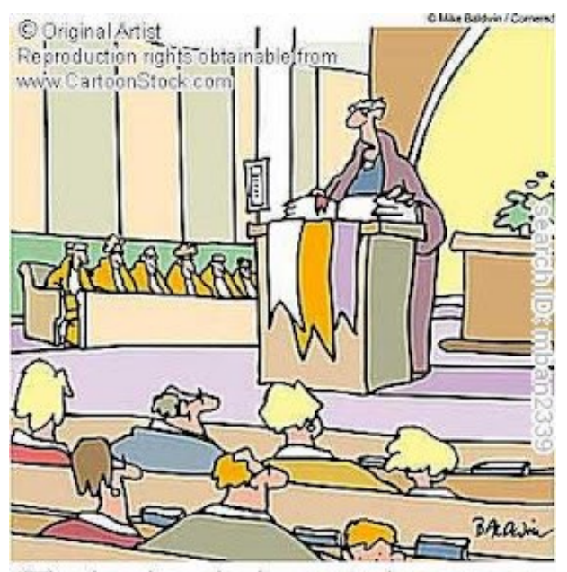
"The Lord works in mysterious ways except on Sundays, when I take over."